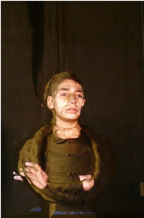
In/Outsiders , 2013. Dox Center for Contemporary Art, Prague © Krzysztof Wodiczko, with courtesy of the artist