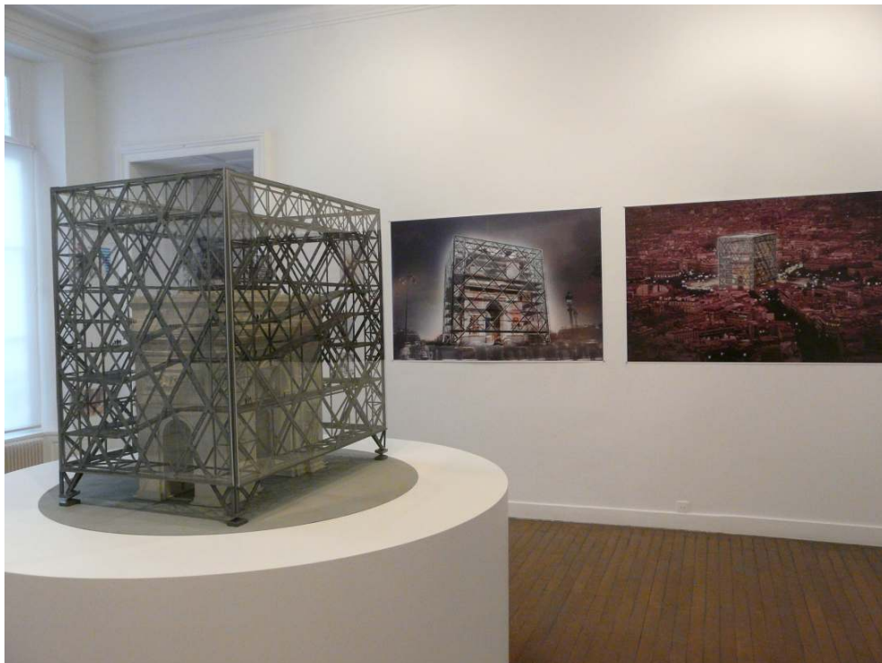
View of the exhibition Arc de Triomphe , Institut mondial pour l'abolition de la guerre, Paris : Galerie Gabrielle Maubrie © Krzysztof Wodiczko, with courtesy of the artist and the gallery